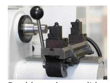
Double-tool cross slide