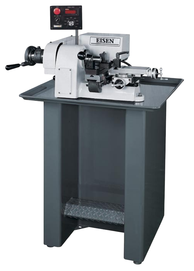
* Some accessories pictured may be optional