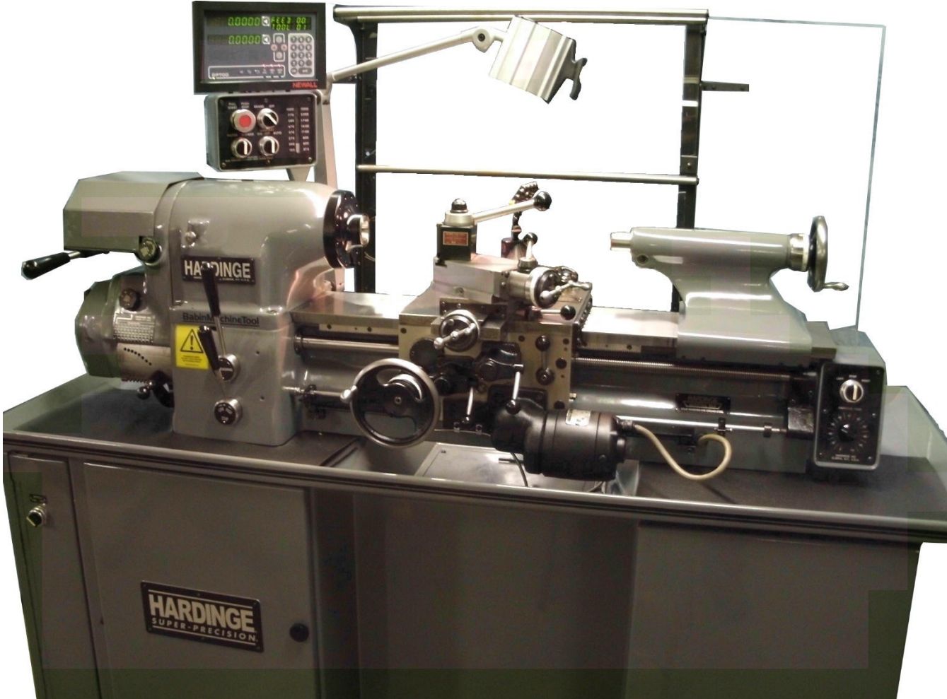
1979 HLV-H-toolroom lathe rebuilt with .0001"res Newall DP700 DRO